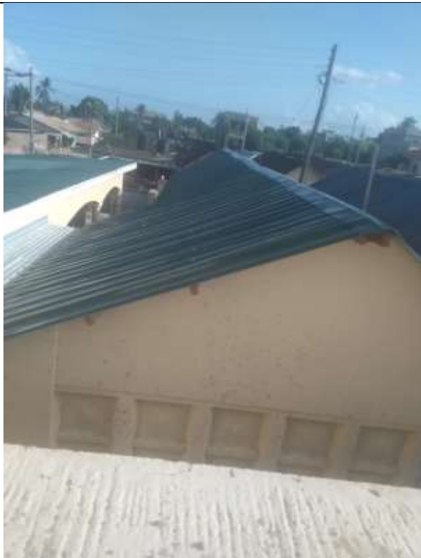
Nyt tag (venstre side)