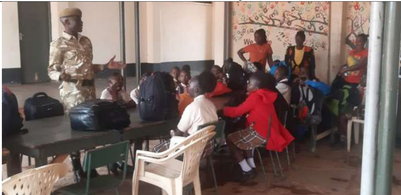
En vigtig del af turen er at en park-ranger fortæller om Tsavo-East, dyrene og planterne. Og fortæller elever og lærere hvad de skal kigge efter.