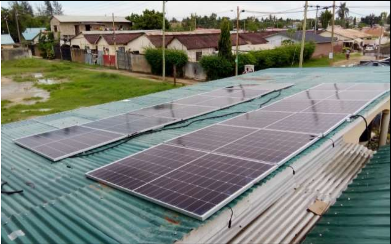
Installationen af solceller er næsten afsluttet