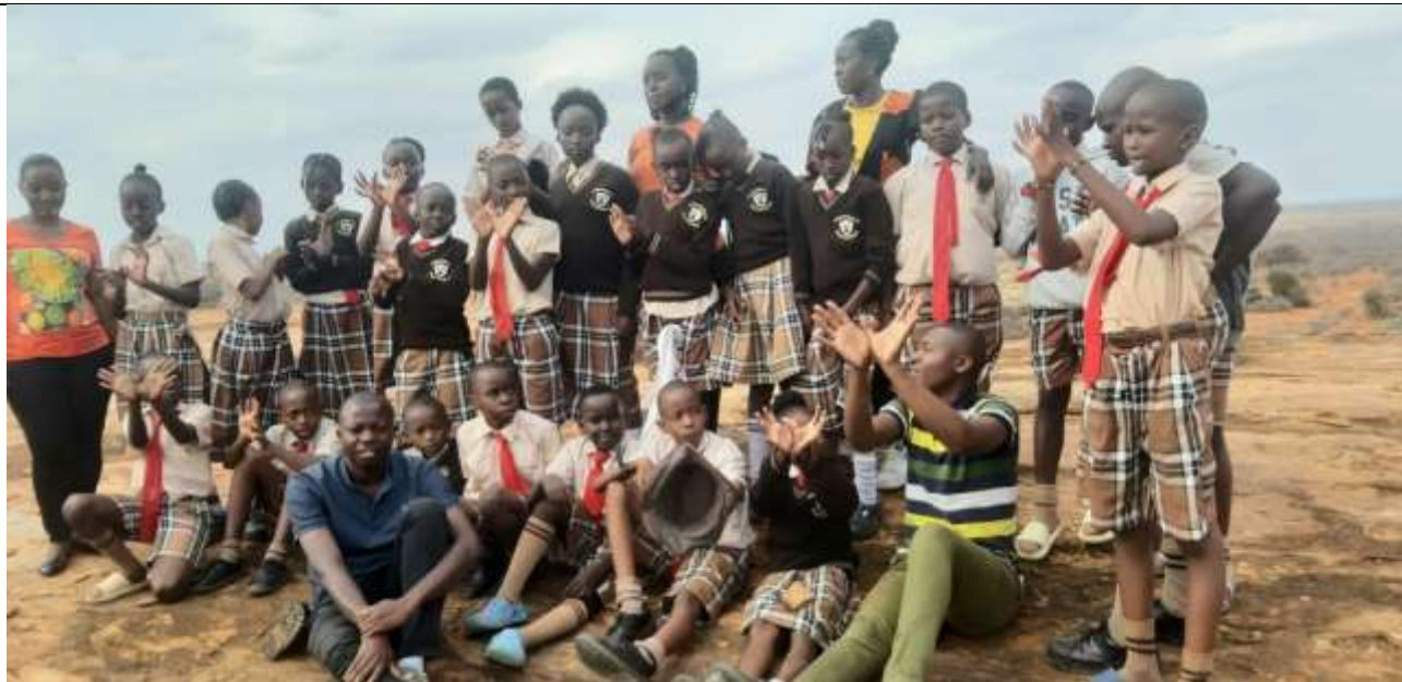
Næsten alle turens deltagere.