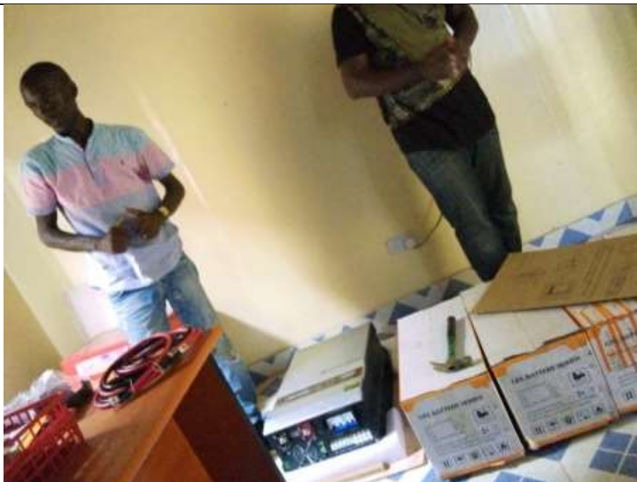
Hardware og planlægning.