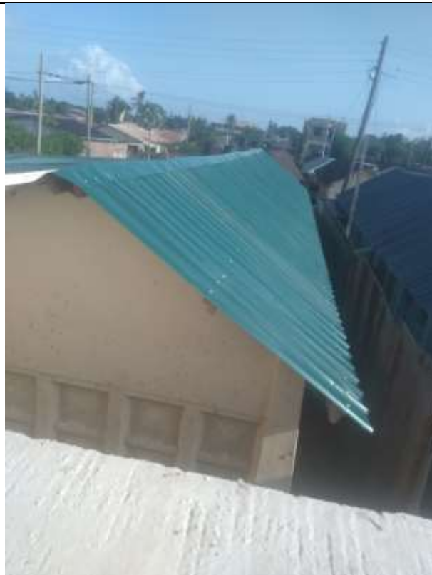
Nyt tag (højre side)